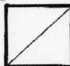
3 1/2 inches square

Step c. Cut along the diagonal line and press the seam to the dark fabric. Repeat until you have 16 half square triangle units like this