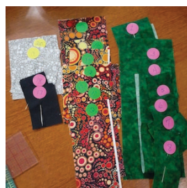
There are numbered pins for purchase but they can be expensive.