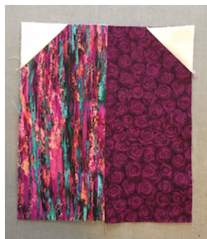
Steps 1 & 2

8 - Join the top to the bottom. Press and trim to 6 1/2" by 12 1/2"